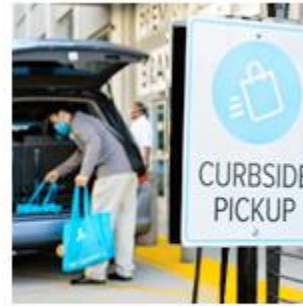
Support Our Local Businesses