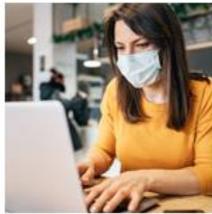
Resources for Our Businesses

Arlington's small business and entrepreneurial assistance network.